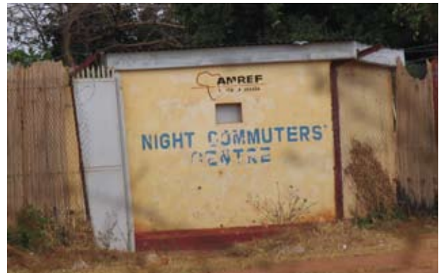
Night commuters' centre, Gulu