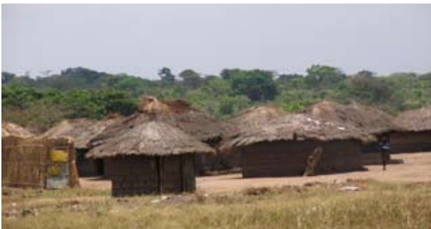
Odek IDP camp, Gulu district

of the nineties stood at between 5,000 and 10,000 combatants, although this figure would have notably reduced. According to various sources, it is currently estimated that the LRA has between 1,000 and 2,000 fighters and a similar number of women and children, although these figures must be taken with a great deal of caution. However, this figure involves an important issue: although the number of fighters has reduced, the group has enough capacity to continue destabilising the region using the same tactics that have characterised it since its formation; that is, acting through small units with great mobility to advance on foot, attack, flee and look for somewhere to hide.