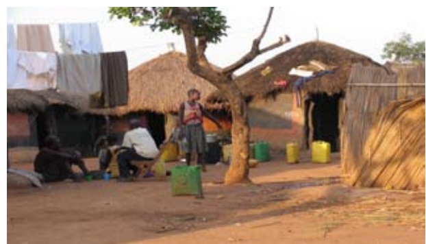
Koro Abili IDP camp, Gulu district